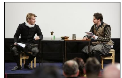
Shakespeare and Cervantes in discussion