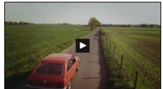
Touring the NW for the EU referendum