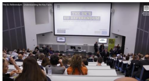
A packed event at MMU

19 May, 16:00-18:00, Lecture Theatre G.36, Manchester Metropolitan University