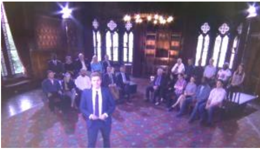
Debating the EU in Manchester Town Hall