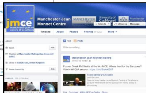
The JMCE Facebook page