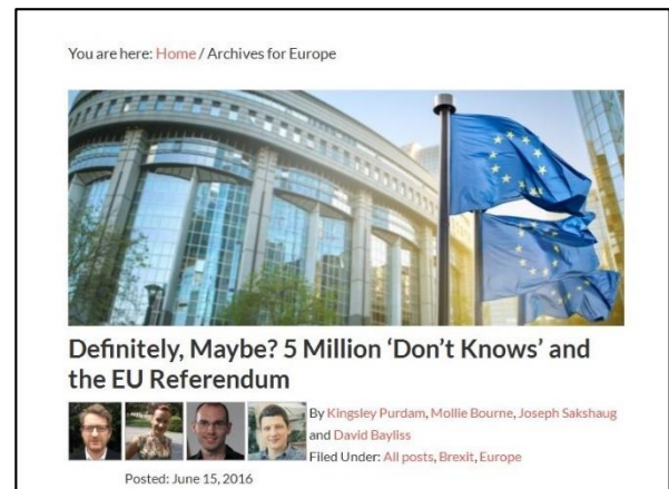
The Blog on Europe at Policy @Manchester

http://blog.policy.manchester.ac.uk/category/europe-stream/ or contact dimitris.papadimitriou@manchester.ac.uk .