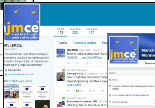
The JMCE on Twitter