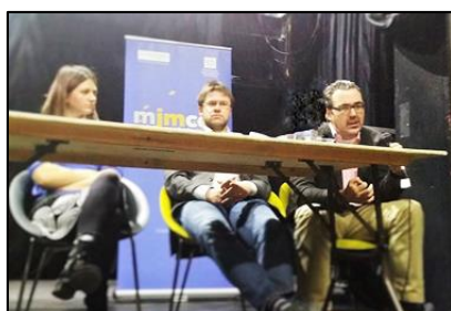
Debating Europe with students

3 March 2016, 6pm, Academy 2, the Students' Union, UoM