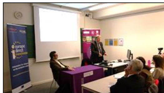
An Irish perspective on Brexit

5 February, 16:30-17:30 University Place, Room 3.211, UoM.