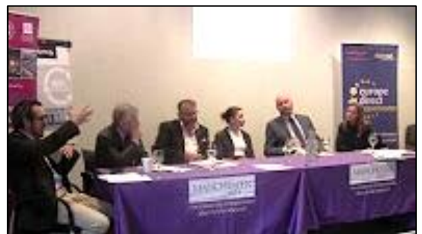
Manchester Devo in European perspective

For the full video of the event please click here: https://youtu.be/EFGs-Q6g6Jl