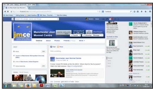
The JMCE Facebook page

Our Facebook page is updated regularly to inform friends of the JMCE of our latest activities. The Centre also has its own tweet feed. Join us!